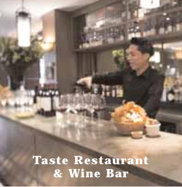
Taste Restaurant & Wine Bar