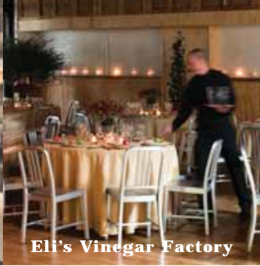
Eli's Vinegar Factory