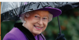
QUEEN ELIZABETH'S SAPPHIRE JUBILEE PORTRAIT