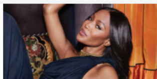
NAOMI CAMPBELL IS OFFICIALLY A LEGEND