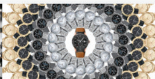
9 OF THE BEST SMART WATCHES YOU'D ACTUALLY WEAR