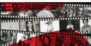
THE 21 MOMENTS THAT DEFINED THE OSCARS