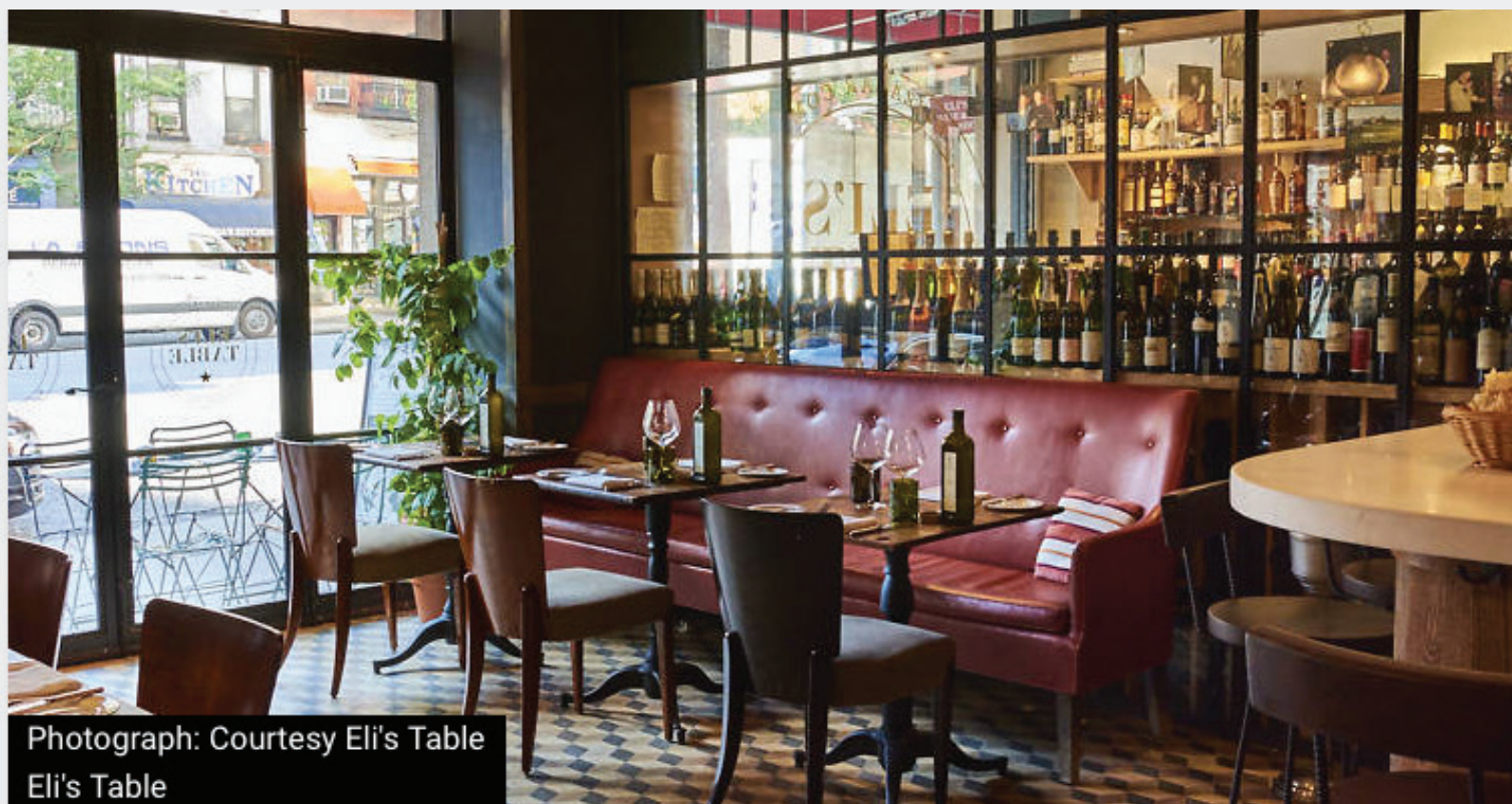
Eli's Table

By Christina Izzo and Time Out contributors Posted: Thursday September 29 2016